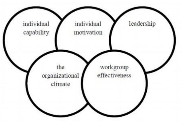
Figure 1. A Climate For The Growth Of Human Capital